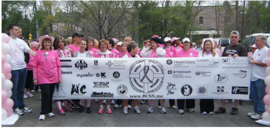
Starting line at the 2 nd Annual Breast Cancer 1-Day Walk

Join us for the 3rd Annual Breast Cancer 1-Day Walk with a theme of 'HOPE FOR THE JOURNEY' Saturday, March 24 th , 2012 at Picnic Park in Peachtree City, GA, as walkers complete a 3.8 mile walk of paved paths around beautiful Lake Peachtree. Check-in begins at 8:30 a.m. with opening ceremonies beginning at 9:00 a.m. Walk Registration is $40 and includes a free t-shirt.